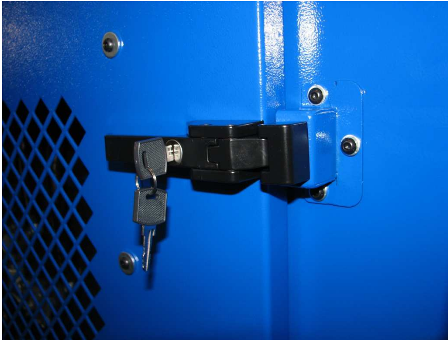
Custom WB-6066 Top Mount Collector door - Lockable maintenance door