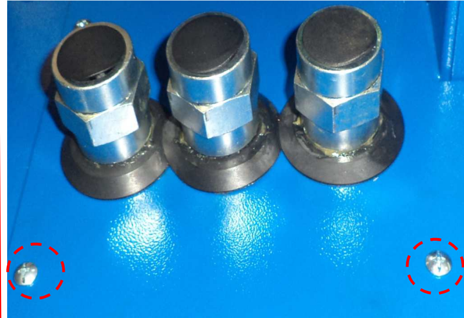
Standard WB-6066 nuts & bolts - Hex bolts