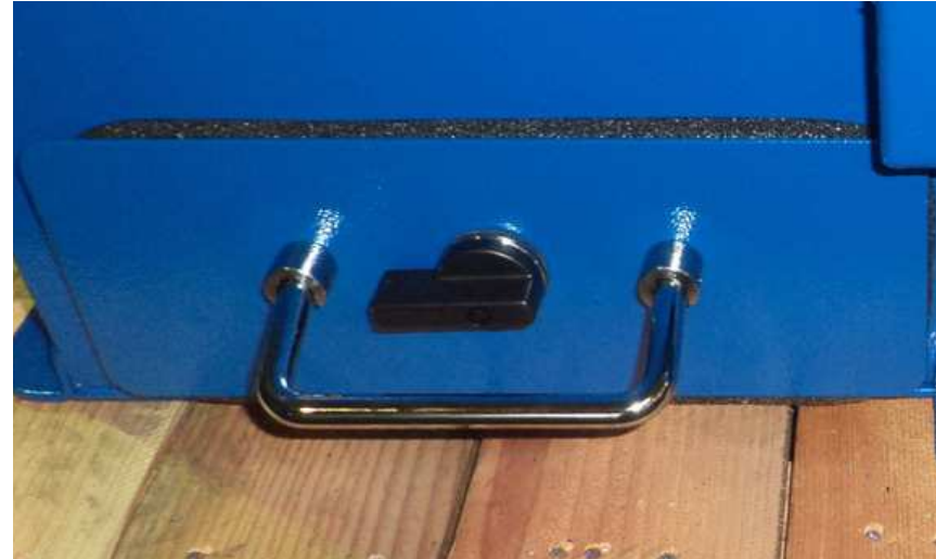
Standard WB-6066 Top Mount Collector drawer - Lockable drawer w/o key