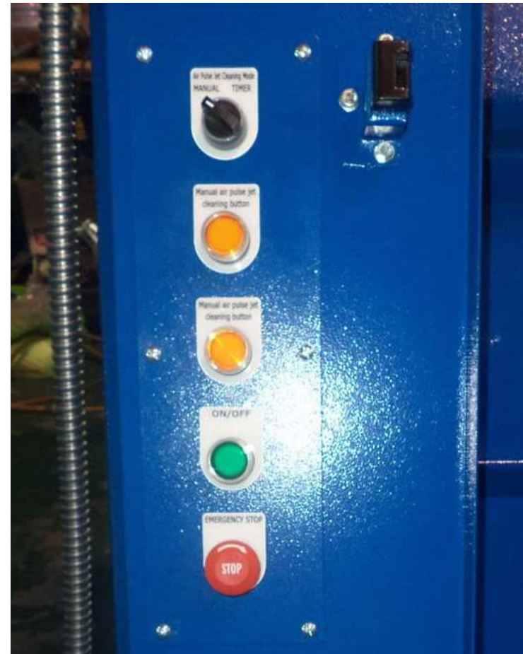
Standard WB-6066 Control bar nuts & bolts