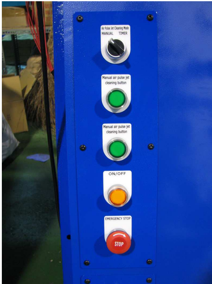
Custom WB-6066 Control bar nuts & bolts