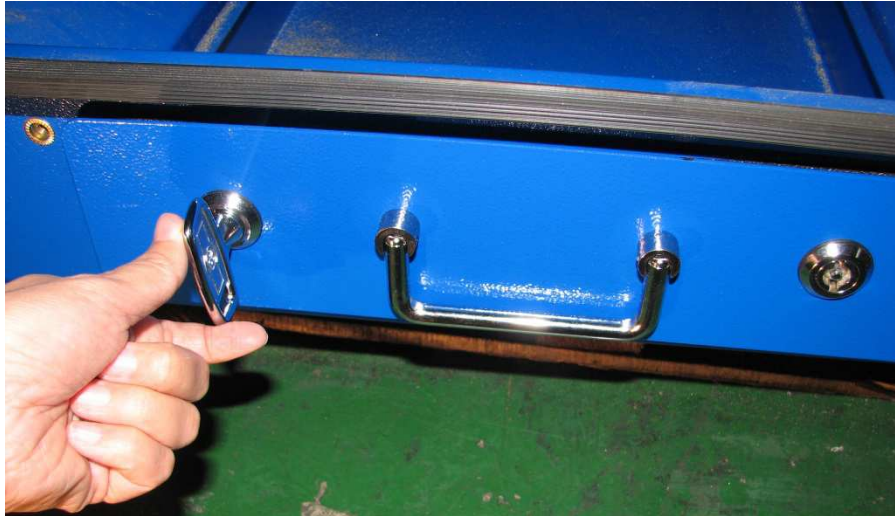
Custom WB-6066 Top Mount Collector drawer - Lockable drawer with key