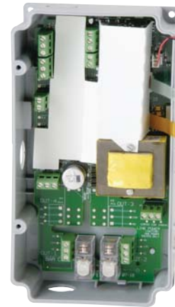
T775M2048 open door with wiring