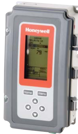
T775M2048 closed door