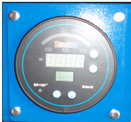
Setting Pressure Gauge location