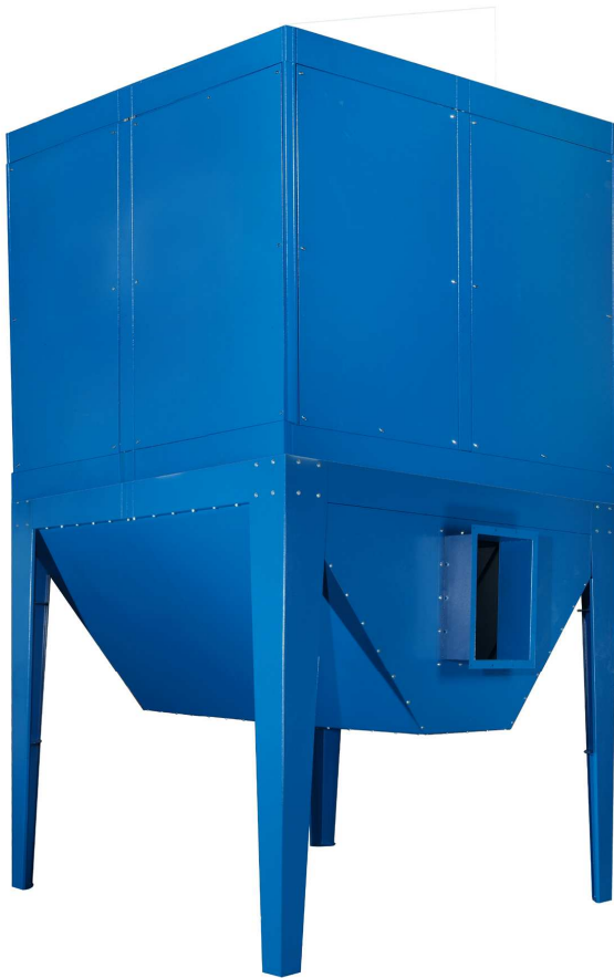
Figure 1: RC-05 (OLD)