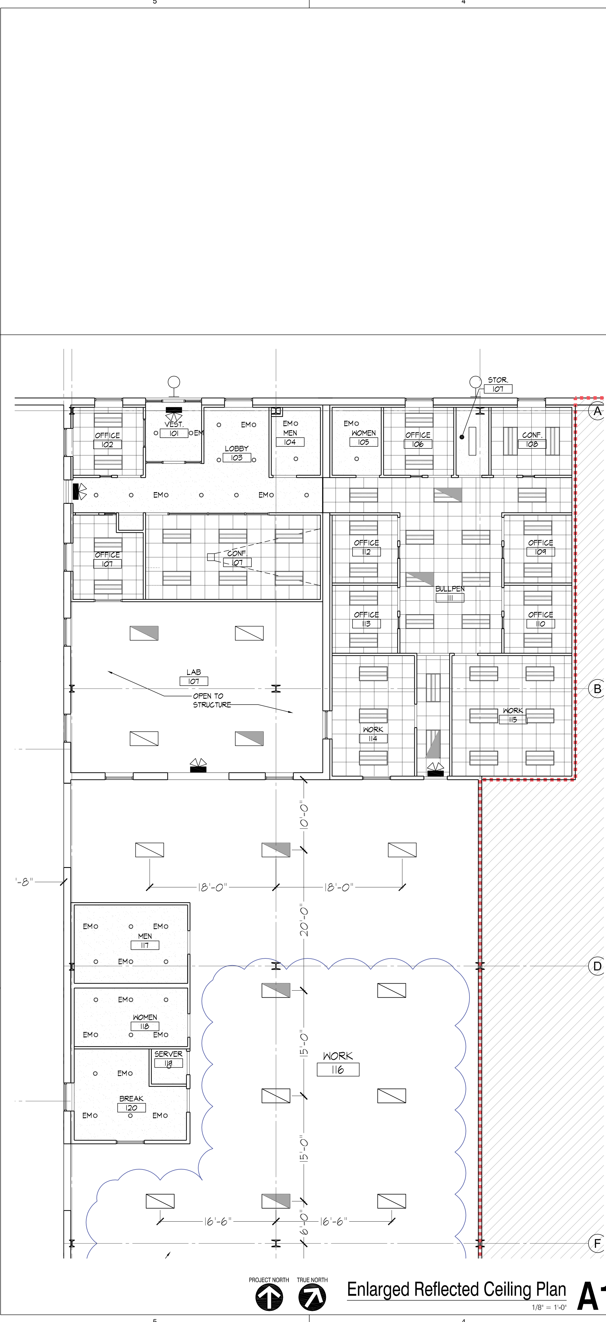
PROJECT NORTH TRUE NORTH Enlarged Reflected Ceiling Plan A1 1/8" = 1'-0"