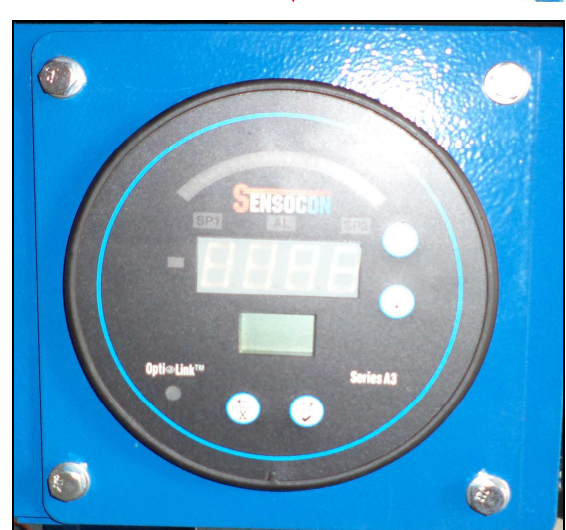
Setting Pressure Gauge location