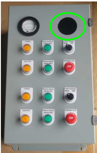
Holes pre-drilled before shipment.

Bob advised us how to function this. Basically, when the pressure reaches the high set point (SP2), the pulse will start pulsing. The pulse jet system continues pulse jet cleaning until the indicator goes back under SP1. During this period, the dust collector is still working. When the pressure reaches the low set point (SP1), the pulse will stop.