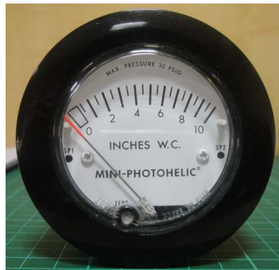
SP2: starts pulse SP1: stops pulse