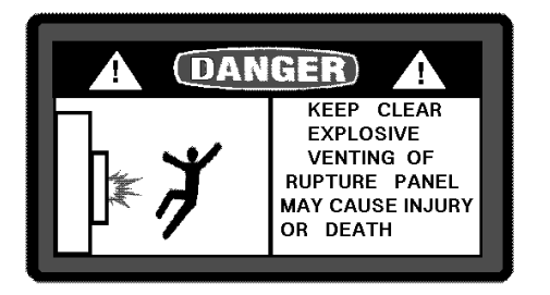
A rupture panel is a precision piece of equipment that must be handled with extreme care. Avoid bending, flexing, scratching,

All rupture panel installations should be located to allow full unrestricted discharge when system pressure exceeds the set pressure of the rupture panel. A rupture panel should never be located where the discharge from a rupture panel will impact people or plant equipment. The warning label shown below is located on the discharge side of the panel. It serves as a reminder to everyone that rupture panels are dangerous when actuated by system over pressure.