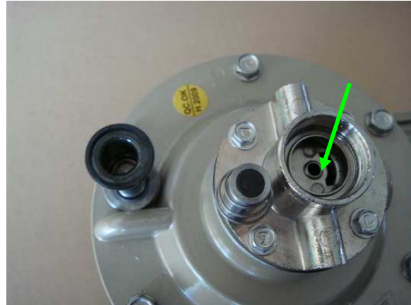
7. Clean the metal chips inside and ensure that no chips clog here.