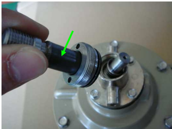
6. Disassemble the screw and the stud.