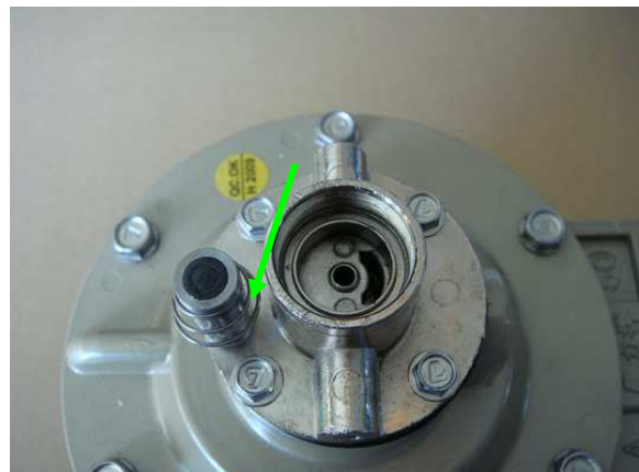
8. Cleanse the stud and ensure that no chips on the surface around the stud.